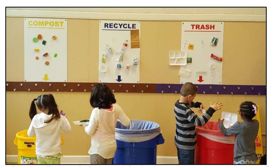
Students at Walberta Park Elementary School in Syracuse participate in OCRRA's cafeteria food scraps recovery compost program. The Westhill School District is one of five total school districts that currently participate in this program: 7,500 total students, across 18 schools, in 5 districts, in Onondaga County are composting their leftover school lunch food scraps on a daily basis.

Schools generate a significant portion of the recyclables in a community, in the form of paper, cardboard and containers. Because of this and the importance of educating children early about recycling, schools are always a major focus of OCRRA's public education. Recycling Specialists regularly visit school custodians, teachers and administrators to help with design and improvement of their recycling programs. OCRRA's Recycling Specialists provided over 100 classroom presentations and assemblies for the 130 schools throughout the county in 2016. In addition, OCRRA gave out its annual Vonnell Mastri award in June, honoring a school with an excellent recycling program in the city of Syracuse. In 2016, the award went to the Ed Smith School in the City of Syracuse School District. An additional triumph of OCRRA's school outreach in 2016 was food scraps composting in the LaFayette School Districts, joining four other school districts in Onondaga County to separate food scraps for OCRRA's large-scale compost efforts.