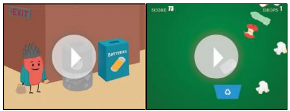
Screenshots of OCRRA's online educational videos and digital games found at ocrra.org.

students about waste reduction, composting and the waste-to-energy process in a convenient online format. The videos and games can be accessed via the internet in and out of the classroom at teacher and student convenience. Students can participate on their own with individual computers, tablets and mobile devices, or they can work together on classroom "smart" boards. The content adheres to NYS curriculum requirements and all topics include a list of vocabulary words with full definitions to review, as well as pre- and post-testing questions to evaluate student knowledge. The program has been well received by both students and teachers in the 90+ classrooms that have executed it in the community so far, with student test scores increasing an average of 13% after completing the activities and videos. Check out the online education program here: http://ocrra.org/services/education-program/