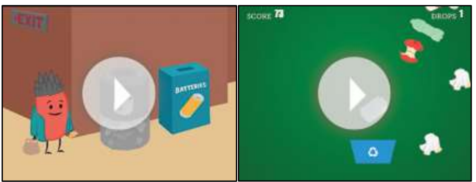
Screenshots of OCRRA's online educational videos and digital games found at ocrra.org.

devices, or they can work together on classroom "smart" boards. The content adheres to NYS curriculum requirements and all topics include a list of vocabulary words with full definitions to review, as well as pre- and post-testing questions to evaluate student knowledge. The program has been well received by both students and teachers in the 122 classrooms that have executed it in the community so far, with student test scores increasing an average of 13% after completing the activities and videos. Check out the online education program here: <a href="http://ocrra.org/services/education-program/">http://ocrra.org/services/education-program/</a>