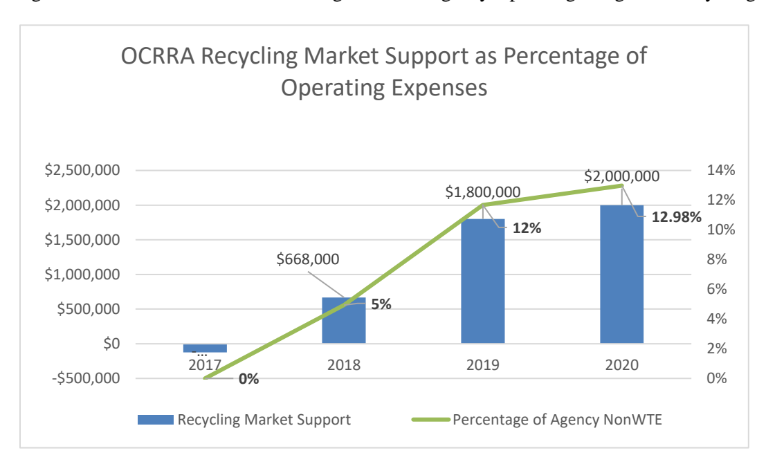
Figure 2 – OCRRA Costs and Percentage of Total Agency Operating Budget for Recycling

imports of recycled material. As a result, the market prices for recycled material dropped precipitously. Payments to WM-RA went up to nearly $670K in 2018 and exceeded $1.8 million in 2019. In 2019, OCRRA had a contract with WM-RA in which the per-ton cost of sorting curbside recycling was not-to-exceed $49 / ton. The contractual per ton not-to-exceed cost increased to $65 / ton in 2020, which resulted in total MRF processing costs of nearly $2 million paid by OCRRA to support curbside recycling. OCRRA's recycling costs now comprise 13% of the Agency expenses, excluding WTE fixed costs. These cost impacts are summarized in Figure 4 below.