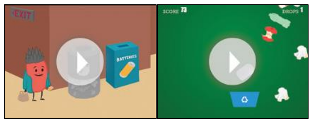
Screenshots of OCRRA's online educational videos and digital games found at <u>ocrra.org</u>.

Additionally, 2020 continued the implementation of OCRRA's interactive, digital online education program. This web-based program includes a series of professionally-produced videos, interactive games and curriculum-aligned classroom activities. Aimed at third through fifth graders, this program teaches students about waste reduction, composting and the waste-to-energy process in a convenient online format. The content adheres to NYS curriculum requirements and all topics include a list of vocabulary words with full definitions to review, as well as pre- and post-testing questions to evaluate student knowledge. The program has been well received by both students and teachers in the 100+ classrooms that have executed it in the community so far. Check out the online education program here: www.ocrra.org/services/education-program/