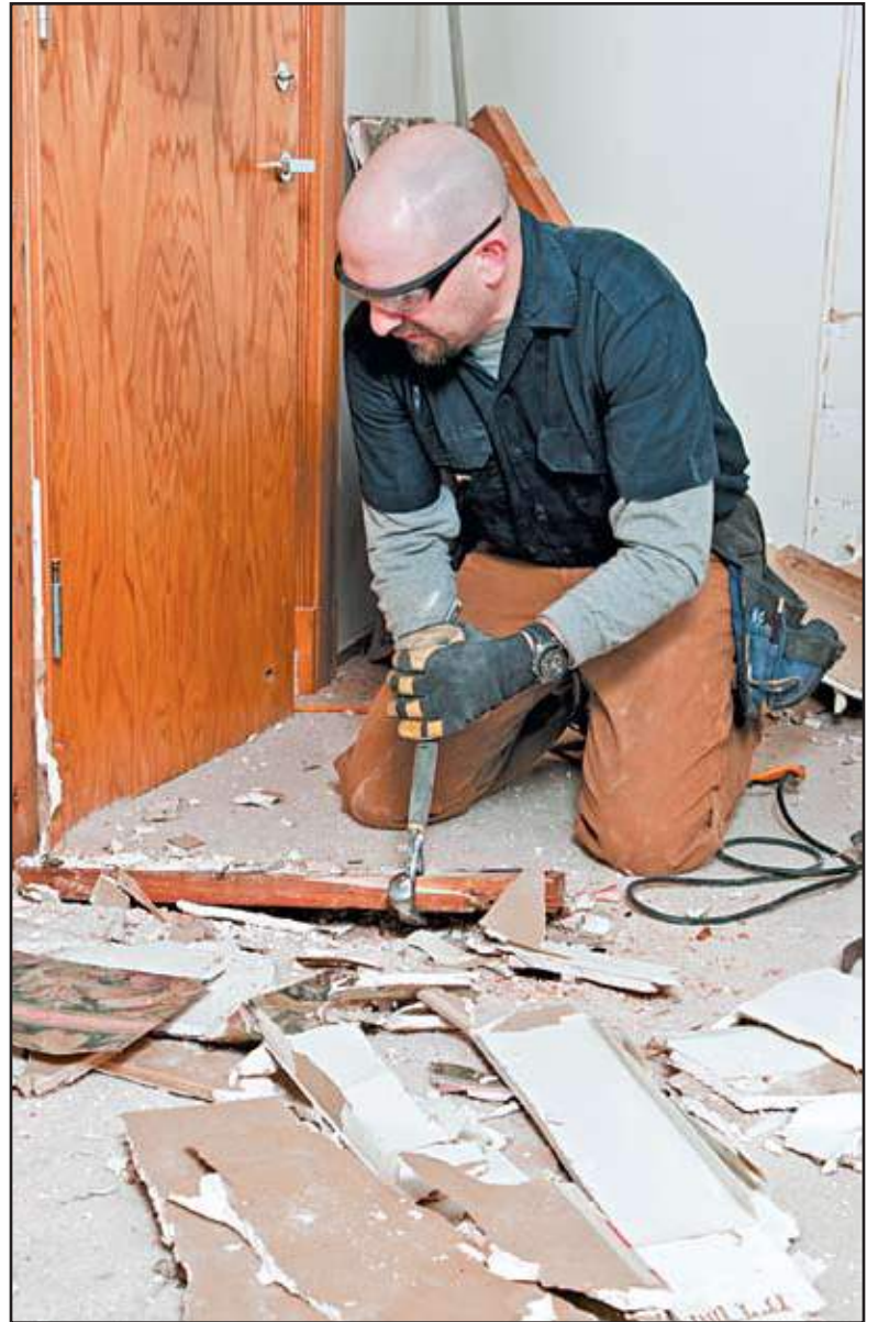
Whether you are a do-it-yourselfer with a few household projects to complete or a contractor with lots of jobs, OCRRA can help you manage your waste and construction debris! OCRRA's Drop-Off Sites make it easy and convenient to get rid of sheetrock, floor boards, paneling, windows, fixtures, roofing, concrete blocks and more.

Mark Donnelly can be reached at mdonnelly@ocrra.org .