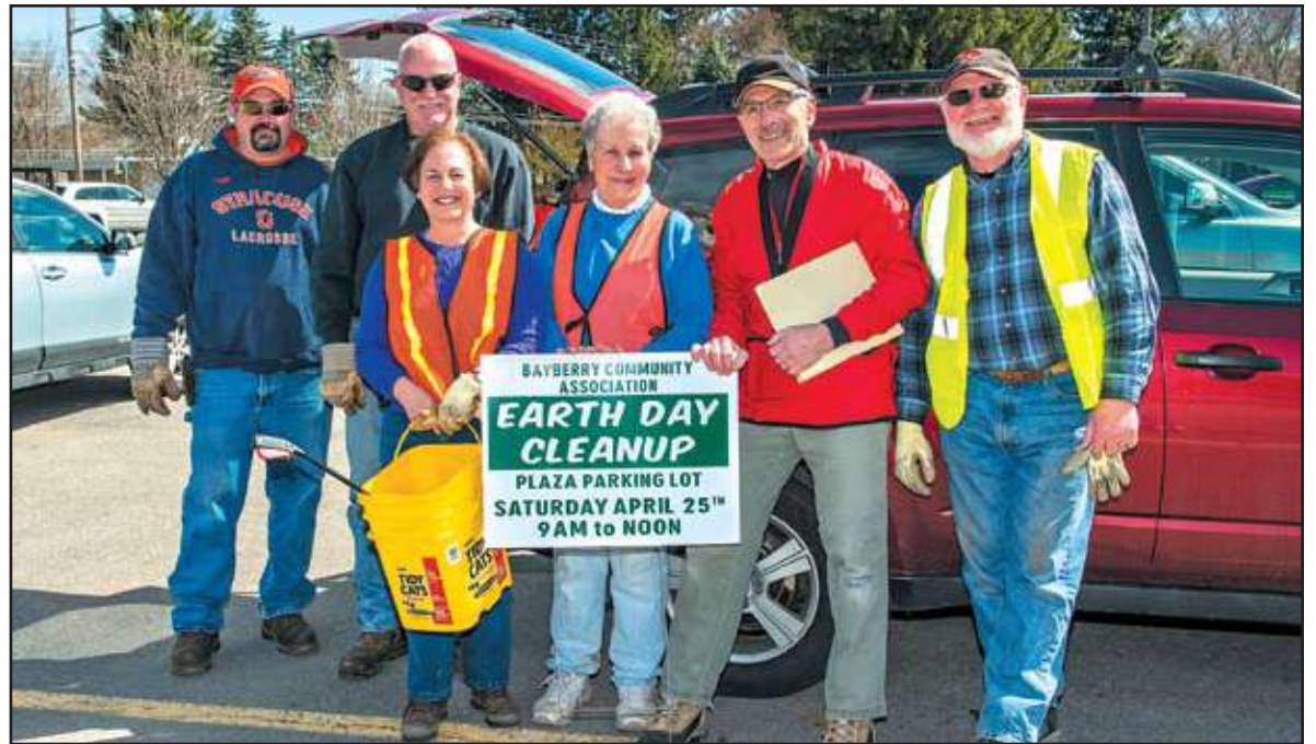
Members of the Bayberry Community Association pause during their 2015 cleanup for a group photo. Join groups like this for the 2016 Earth Day Litter Cleanup happening April 22 and 23. Help beautify Onondaga County! The registration deadline is April 15. Register online or by filling out the form below.

According to the international Earth Day Network, the dedicated and tireless volunteers, along with the hard work of our local highway crews, has made