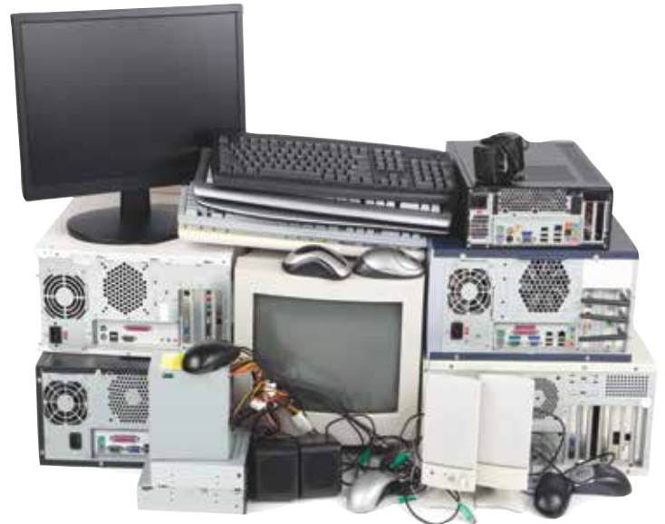
New York state is updating electronics recycling regulations and that will impact where you can drop off e-waste.

Since the full list of electronics drop-off locations is not defined at the time of publication, you can join OCRRA's email list for updates and details as they develop. Look for the green "Join our mailing list" section at the bottom of any page on OCRRA.org to register.